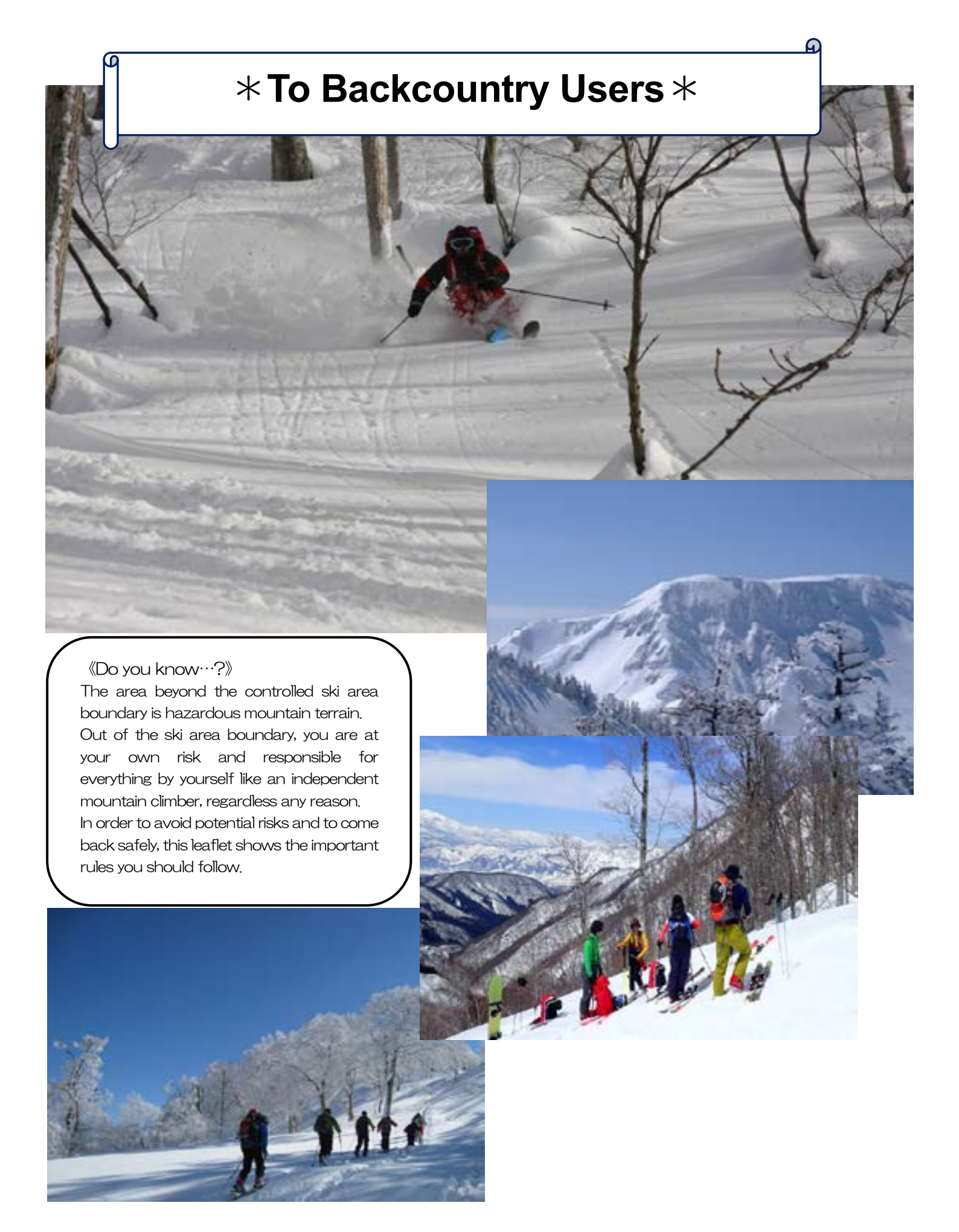
Japan Association for Skiing Safety